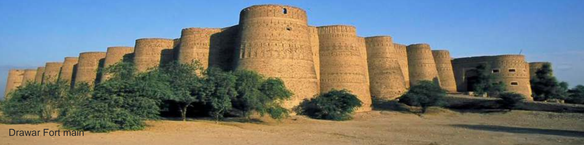
Drawar Fort main