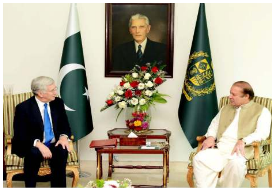
British Secretary of State for Defence Rt. Hon Michael Fallon called on Prime Minister Muhammad Nawaz Sharif at PM House, Islamabad on August 5, 2015.

The Defence Secretary underlined the importance of bilateral relations with Pakistan and said that this relationship continues to deepen in the interest of both the nations. The British secretary also appreciated the role of Pakistani Diaspora in Britain. Both sides agreed on cooperation between the two countries under the Enhanced Strategic Dialogue (ESD).