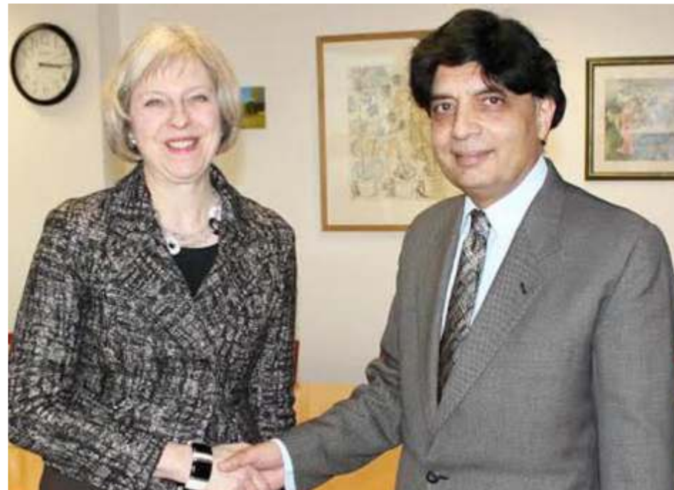
Interior Minister Ch. Nisar Ali Khan Shaking Hands With His British Counter Part Ms. Theresa May in London On August 26th, 2015

Secretary Theresa May in her remarks said that UK values its ties with Pakistan and desires to further cement them. She recognized Pakistan's sacrifices in fight against terrorism and efforts for regional peace. Ms May also assured the Interior