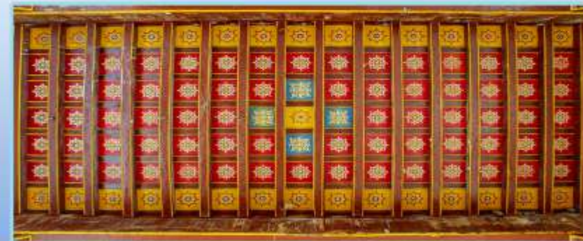
Ceiling-of-Nawab's-room in Drawar