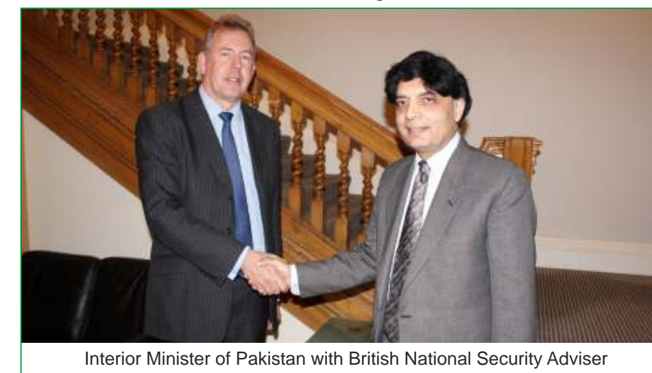
Interior Minister of Pakistan with British National Security Adviser

of her government's Pakistan's comprehensive commitment to support Pakistan in all areas of cooperation. In his meeting with British National Security Adviser (NSA) Sir Kim Darroch, at the Cabinet Office, 10 Downing Street, Chaudhry Nisar Ali Khan exchanged views on matters of mutual interest in both bilateral and regional context. Expressing satisfaction on the upward trajectory of Pakistan-UK relations, both sides agreed to continue the momentum of cooperation in a wide range of areas with particular focus on security cooperation. The Minister underscored UK's important role in bringing East and West together in fight against extremism. Sharing