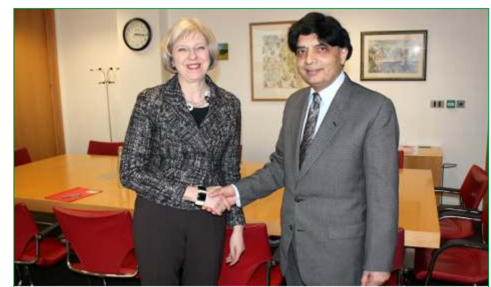
Interior Minister of Pakistan with British Home Secretary

between Pakistan and UK have attained a new level during the recent years. The Interior Minister underscored the important role West could play in countering the narrative of Islamophobia created by certain groups spreading religious intolerance. The Minister said that rights of democracy and freedom of speech should be used with responsibility, without humiliating any faith or religious beliefs. He further emphasized that fight against terrorism and extremism could only be won through global unity and international cooperation. Home Secretary May expressed satisfaction on close and friendly relations between the two countries. Appreciating Pakistan's sacrifices in the fight against terrorism, she assured