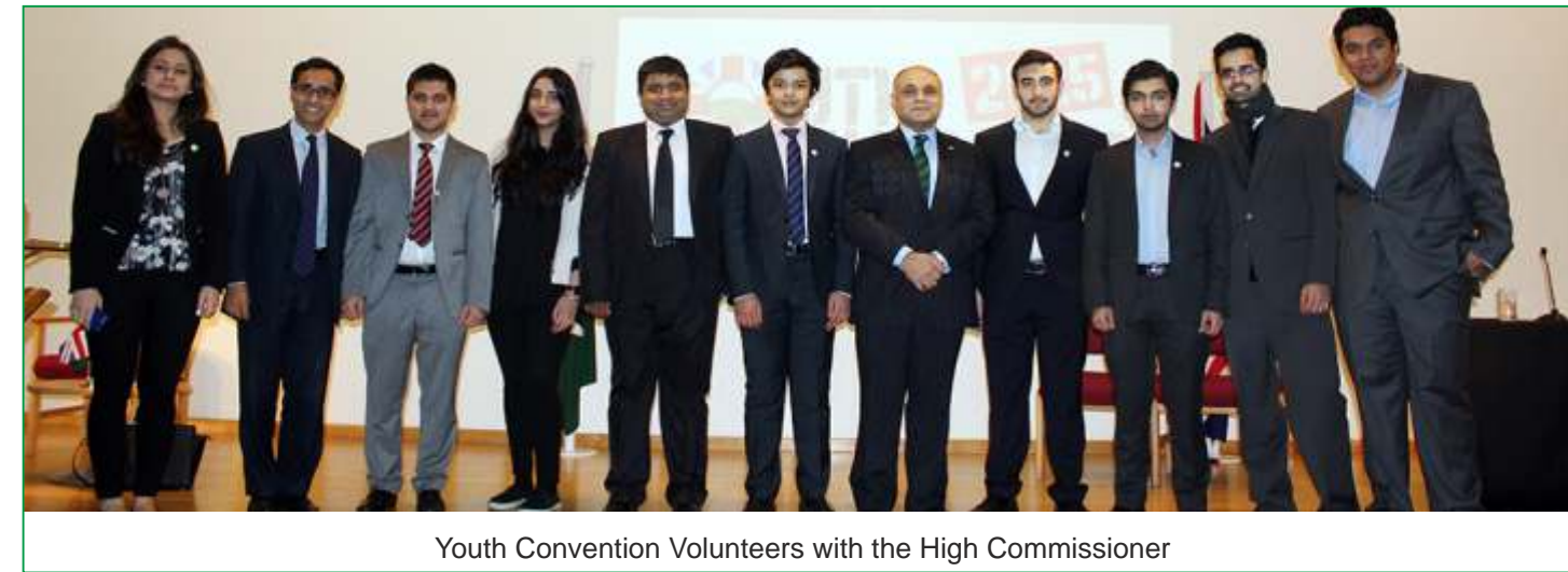
Youth Convention Volunteers with the High Commissioner